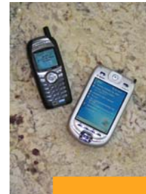
Cell Phone & PDA